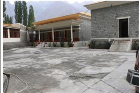
Figure 6: PWD; septic tank area