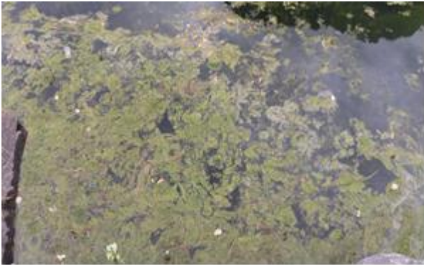
Figure 3: Shangrila; Massive Algal bloom in front of VIP suite