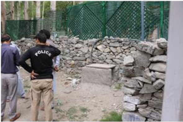
Figure 5: FCNA; central septic tank