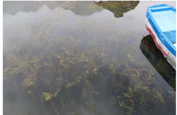
Figure 10: GB-SCOUTS; discoloration and eutrophication due to mixing of kitchen and washroom effluents