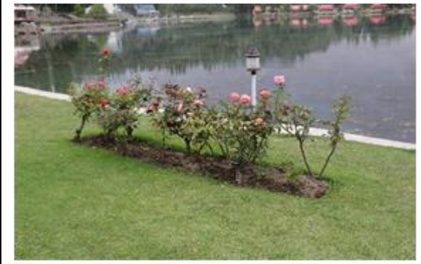
Figure 8: Shangriila; Flowerbeds Fertilized, potential pollution source