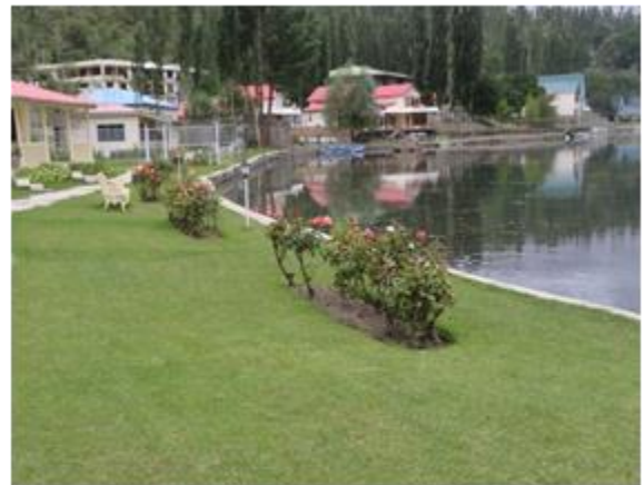
Figure 12: Shangrila: flowerbeds sloping towards Lake