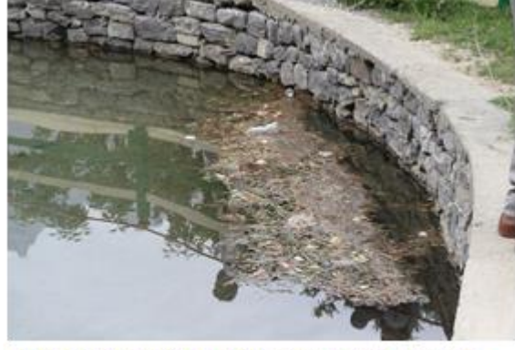
Figure 2: Shangrila; Empty bottles, plastic bags and wrappers