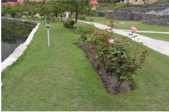
Figure 1: Shangrila; Flower beds and trees along the edge of Lake