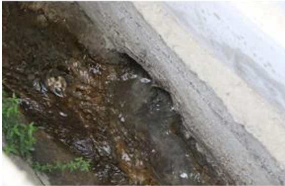
Figure 9: GB-SCOUTS; kitchen and washroom effluent directly entering into water channel feeding the Lake