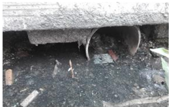
Figure 7: Sahngriila; kitchen drain directed towards Lake