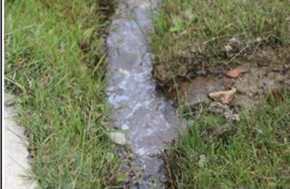
Figure 4: Shangrila; seeping water containing oil and grease in front of VIP suite