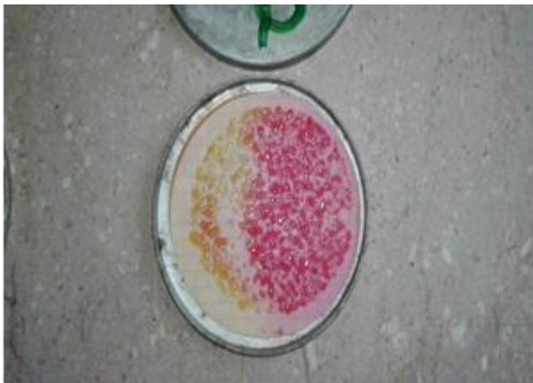
Figure 11: Lake sample (infront of Shangrila): E.Coli TNT